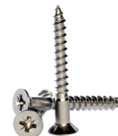
DIN7997 Flat head wood screws