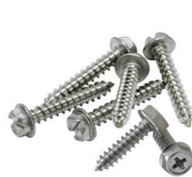
Hex head self tapping screws