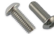
Stainless steel button head socket screw ISO7380