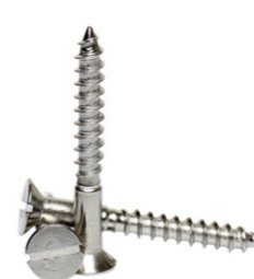
DIN97 Flat slotted head wood screws