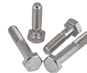
Stainless steel bolt DIN931