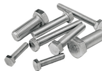
Stainless steel bolt DIN933