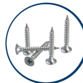
Stainless steel bugle head fine thread drywall screws