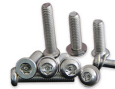
Stainless steel security screw with Pin