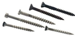
Black painted decking screws