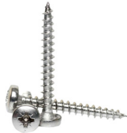
Stainless steel pan head chipboard screw