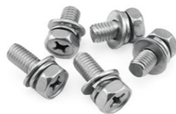
Stainless steel hex philips sems screws