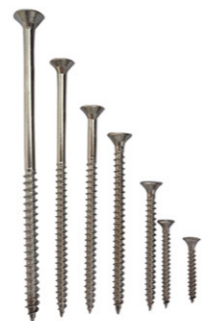
Stainless steel countersunk head chipboard screws