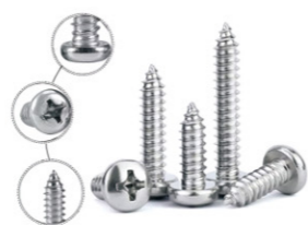
Pan head self tapping screws