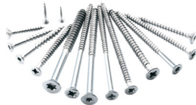
Stainless steel CSK head chipboard screws