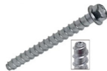
Stainless steel hex washer head concrete screw