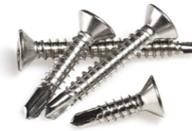
Stainless steel flat head self drilling screw DIN7504P