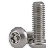
Stainless steel torx machine screw with pin