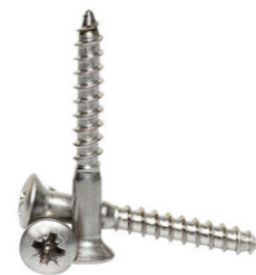
Raised CSK head wood screw DIN7995