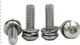
Stainless steel ISO7380 sems screws