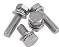
Stainless steel hex head sems screws