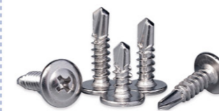
Stainless steel wafer head self drilling screw