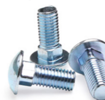
Stainless steel carriage bolt