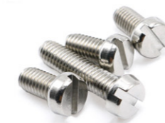
Stainless steel cylinder slotted machine screw DIN84