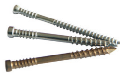
Stainless steel cylinder head decking screws