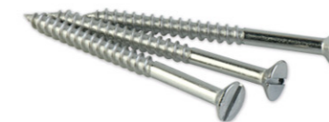
Stainless steel flat head slotted wood screws