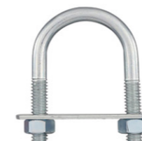
Stainless steel U bolt