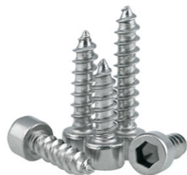
DIN912 Cylinder head self tapping screw