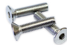
Stainless steel flat head socket machine screws