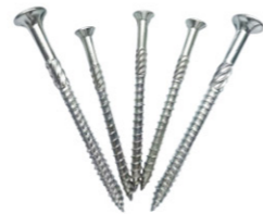
Stainless steel decking screw with knurling saw thread