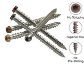
Stainless steel deck screw, star torx, dacromet coating