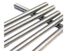
Stainless steel thread rods DIN975