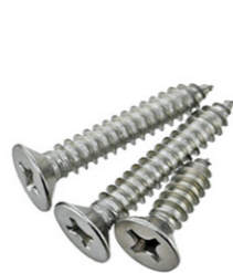
Flat head self tapping screws