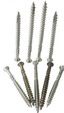
Stainless steel csk head torx chipboard screws