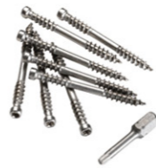
Stainless steel cylinder decking screw type 17