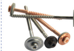
Wood decking screw