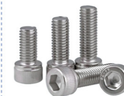
Stainless steel socket cap bolt