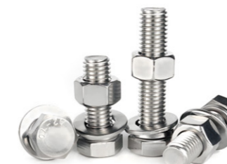
Hex bolt with washer and nut