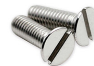
Stainless steel slotted machine screws