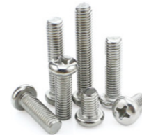
Stainless steel philips pan head machine screws