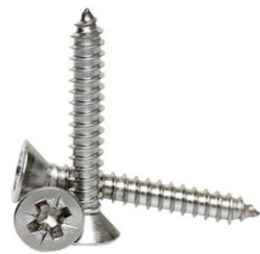
A2 csk head Pozi chipboard screws