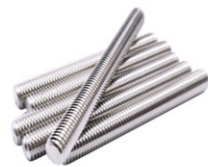
Stainless steel thread bar DIN976