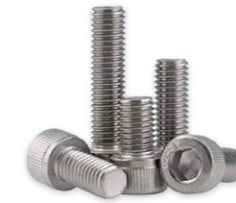
Stainless steel socket cap screws DIN912