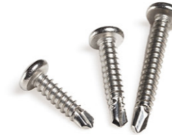
Stainless steel pan head self drilling screw DIN7504N