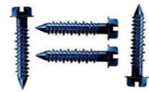
Stainless steel hex slotted head concrete screw, ruspert coating