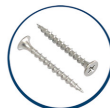
Stainless steel bugle head coarse thread drywall screws