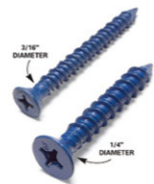
Stainless steel flat head H-L thread concrete screws