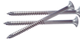
Stainless steel timber batten screw