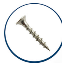
A2 Philips bugle head drywall screw