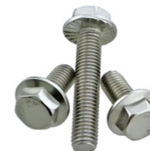
Stainless steel hex flange bolt DIN6921