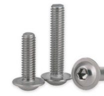
Stainless steel button head socket machine screw ISO7380-2