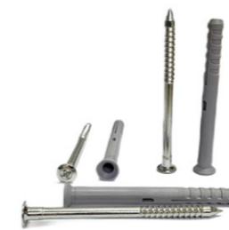
Nylon hammer nail screw