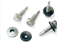
Stainless steel hex head self drilling screw DIN7504K