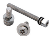
Stainless steel sems screw