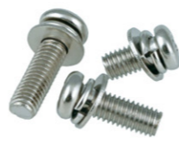
Stainless steel pan head sems screws