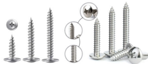
Truss head self tapping screw