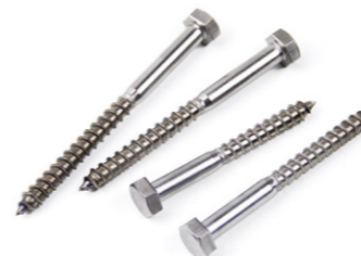
DIN571 Hex head wood screws