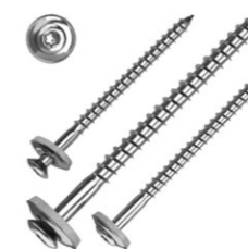
Wood screws with washer