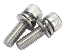
Stainless steel DIN912 sems screws