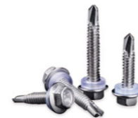
Stainless steel hex head self drilling screw with PVC washer