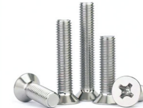
Stainless steel philips flat head machine screws