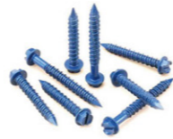
Stainless steel hex head slotted concrete screw, diamond point