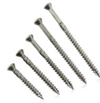
Stainless steel trim head torx decking screw